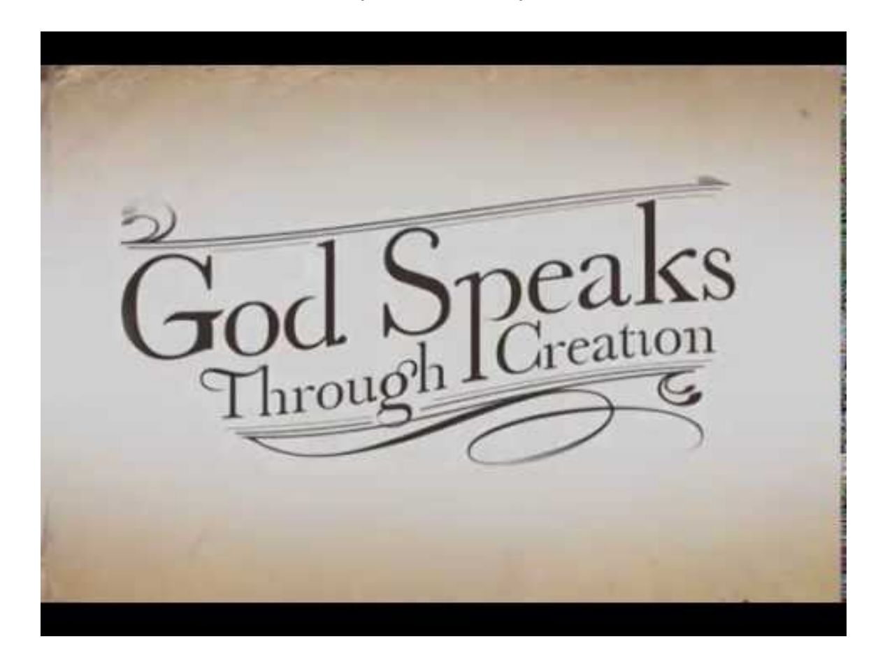
Doves 13 - #405 - Four Eclipses of 2017 point to 9/9/2018